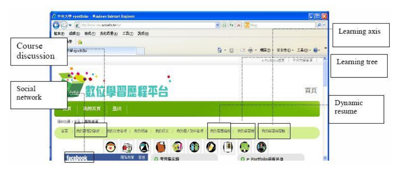
Fig. 2. e-Portfolio platform